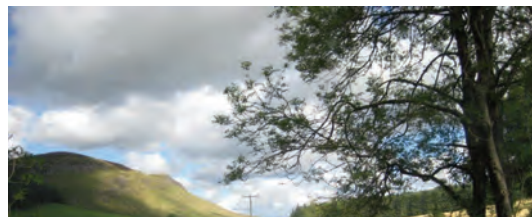
Birnam Oak and Dunsinnan Hill