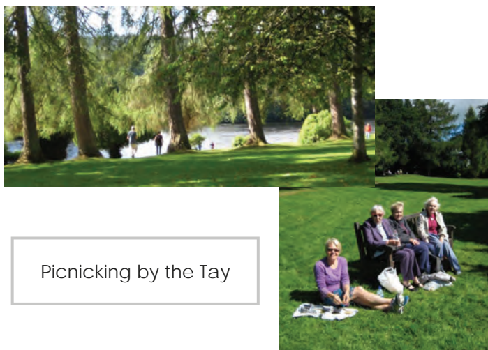
Picnicking by the Tay